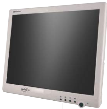
LCD Brightness Control Power On/ Off Speaker Volume Control